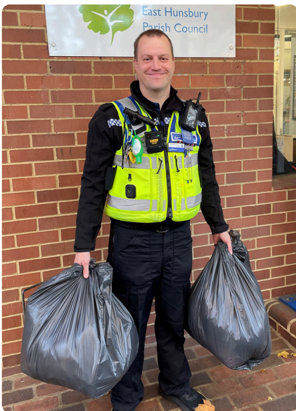
coat collection

The Police, by the nature of their work, frequently work with vulnerable adults and took 6 coats to distribute to adults in need. The Hope Centre, based in Northampton supports people in the county struggling with homelessness and issues relating to hardship, including addiction, mental health, wellbeing, and deliver projects aimed at early intervention. Thirty four coats were gifted to the Hope Centre to support the wellbeing of vulnerable people by keeping them warm.